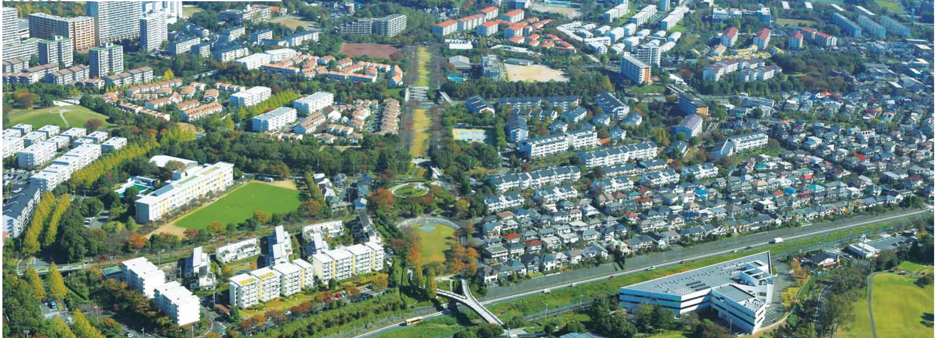
Tsurumaki and Ochiai districts, Tama New Town

Tama New Town, the construction of one of the largest (approx. 2,900ha) new town development projects in Japan, was launched in 1965. The project was launched in the Tama area, about 20-30km from the heart of Tokyo, aiming to form a designed urban housing area and a mass supply of quality housing, in order to solve the lack of housing and urban sprawl which became a serious issue in Tokyo due to the over-concentration of population and industries in the city during the period of rapid economic growth. UR contributed in instituting the masterplan, implementing the extensive area development project of approx. 1,400ha, and supplying housing etc.. Today the town has grown into a city of approx. 90,000 households and a population of approx. 220,000.