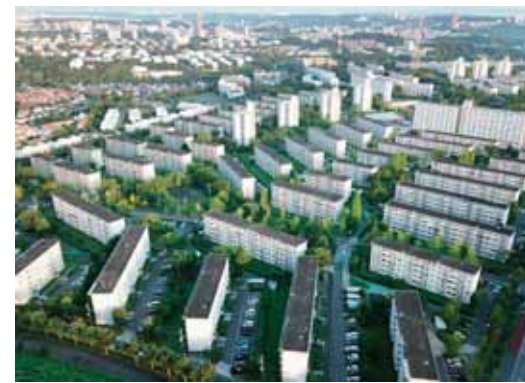
One of the leafy rental housing complexes constructed and managed by UR [Nagayama Housing Complex, 3,253 housing units]

Locations : Inagi City, Tama City, Hachioji City and Machida City, Tokyo Site area : Approx. 2,900ha