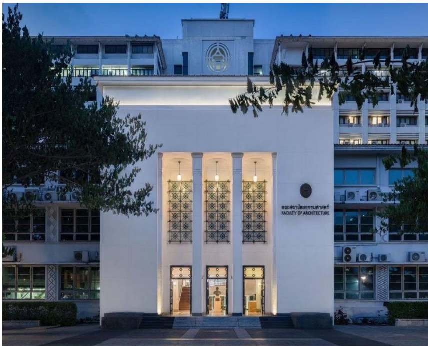
Faculty of Architecture Building, Chulalongkorn University

This time, UR has exchanged an MOU with Chulalongkorn University, the first higher education institution in Thailand, recognized as a top educational and research institution in Asia. This MOU exchange aims to establish cooperation in urban research and development projects with related agencies both in Thailand and abroad to help solve traffic congestion problems, reduce unplanned urban sprawl, promote sustainable urban development, and foster new forms of urban development. UR will leverage its 'experience and expertise in carrying out more than 500 2 urban development projects in Japan' in collaboration with Chulalongkorn University, which has 'research capabilities and expertise in urban development and spatial management in Thailand.' Additionally, both parties plan to collaborate in organizing a forum in the near future as the first step of their cooperation.