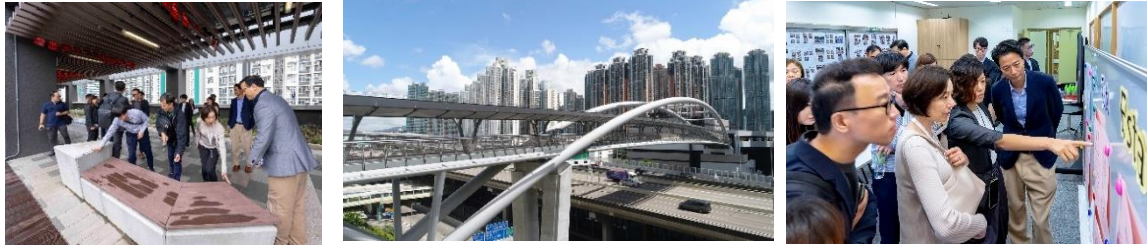
Exploring Hoi Tat Estate area

On the second day, we visited the Hoi Tat Estate with the guidance of HKHA. The Estate is a mixed-use development of more than 3,000 units in four buildings, contains commercial and public facilities, and the long-span footbridge (145 meters long and 6 meters wide) connecting two housing complexes built by HKHA.