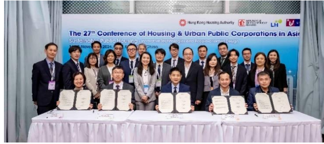
Signing ceremony of the Agreement

On the second day, we visited the Hoi Tat Estate with the guidance of HKHA. The Estate is a mixed-use development of more than 3,000 units in four buildings, contains commercial and public facilities, and the long-span footbridge (145 meters long and 6 meters wide) connecting two housing complexes built by HKHA.