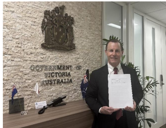
Photo of the signing of the MOU