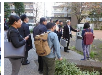
Explain the disaster prevention park in Acty Sangenjaya

After the lecture, he guided the area by walk, participants checked the Acty Sangenjaya with a disaster prevention park, the widened urban planning road to two lanes, and the City Court Kamiuma, which was improved by setting up a pocket park at sharp turn. He emphasized that the tips to the success of the road widening