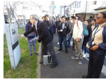
Visit City Court Kamima