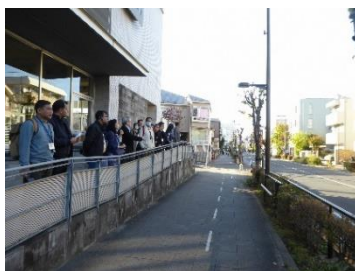
Check the widened urban planning road and community road around Acty Sangenjaya

Participants asked a variety of questions, such as what kind of rules was used to implement the projects, the land reduction's mechanism through land readjustment, and the profits that can be earned from the project. Finally, a Thai participant, who was a representative of the group expressed appreciation that they learned a lot from the lecture and its actual site.