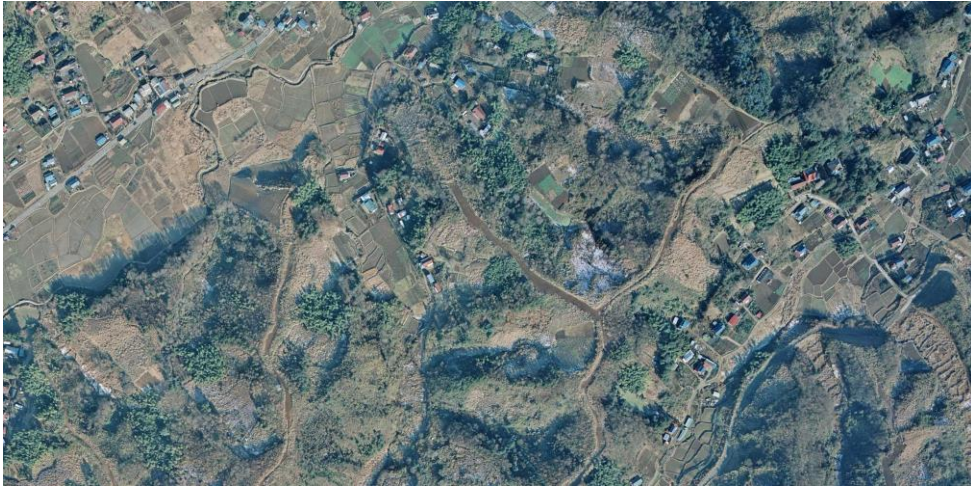
A part of project area

Source: Geospatial Information Authority of Japan