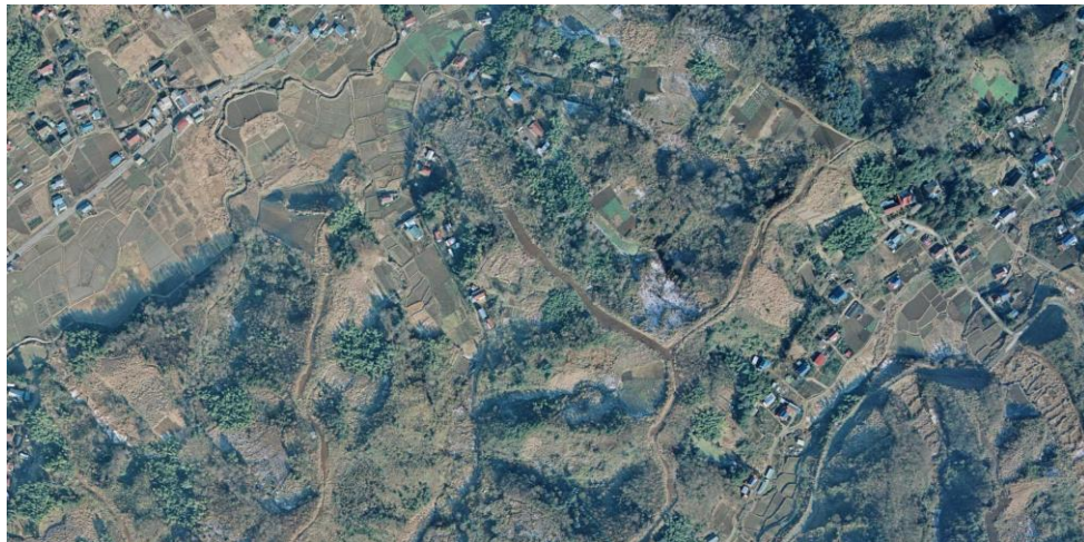
A part of project area

Source: Geospatial Information Authority of Japan