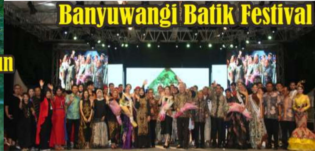
Banyuwangi Batik Festival