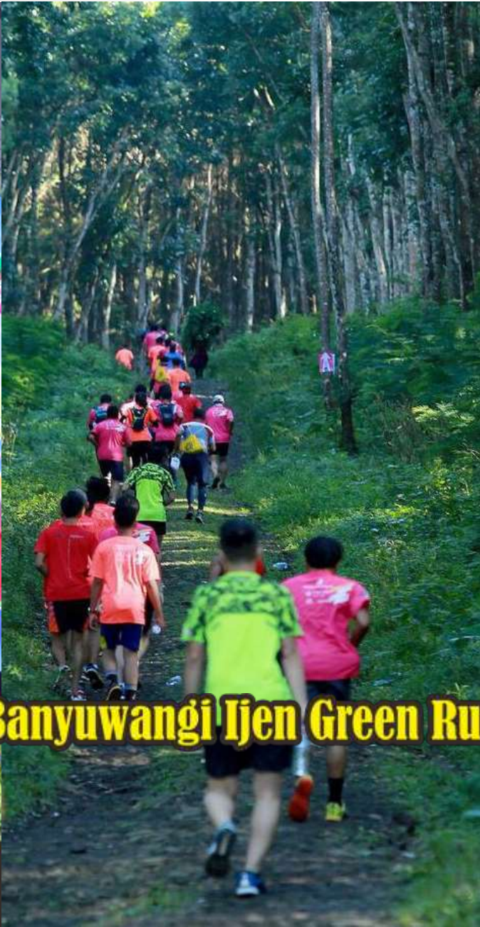
Banyuwangi Ijen Green Run

There are many tourist attractions in Banyuwangi city, as a tourism event and a promotion of cultural and natural conservation: