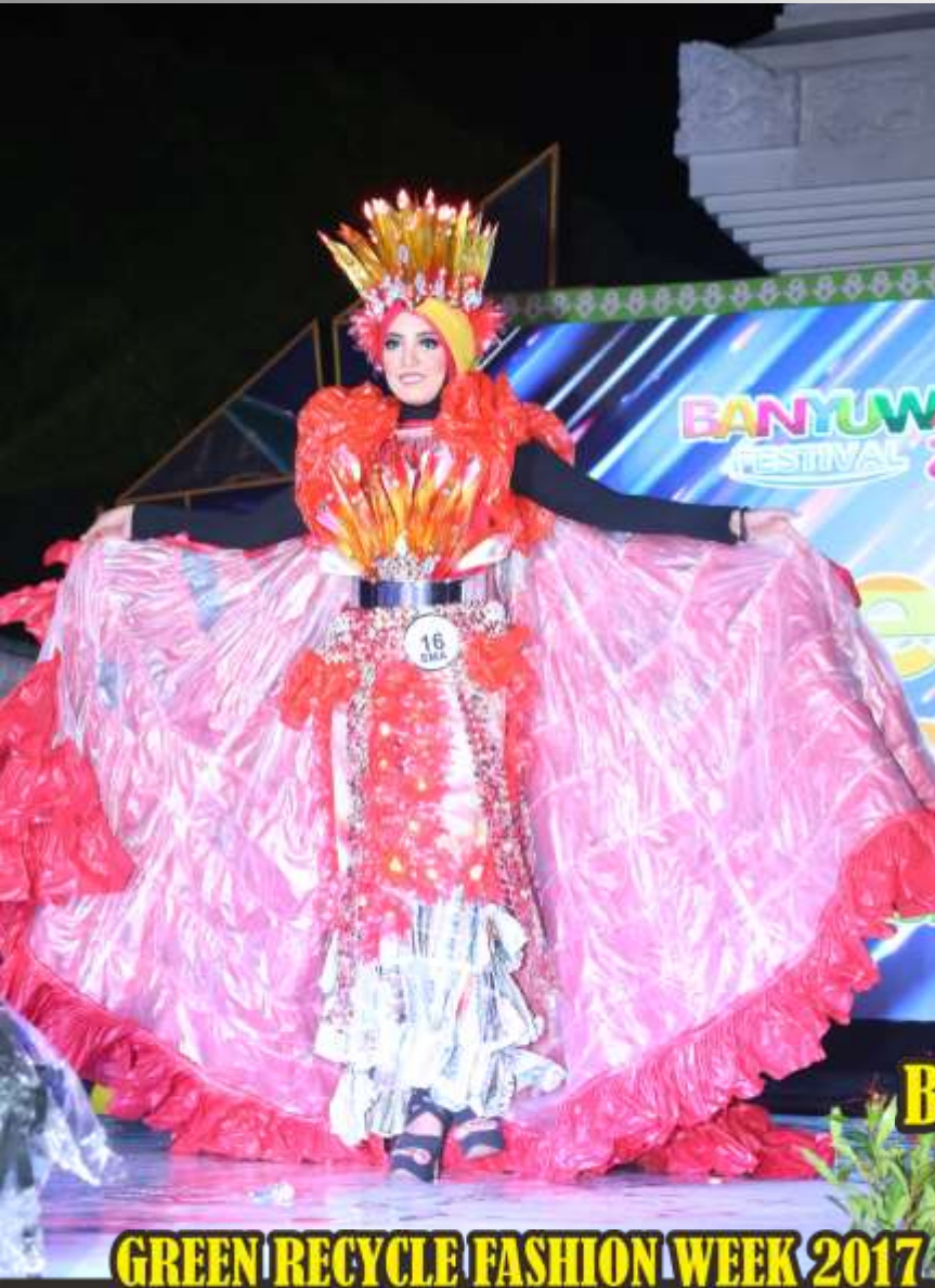
GREEN RECYCLE FASHION WEEK 2017