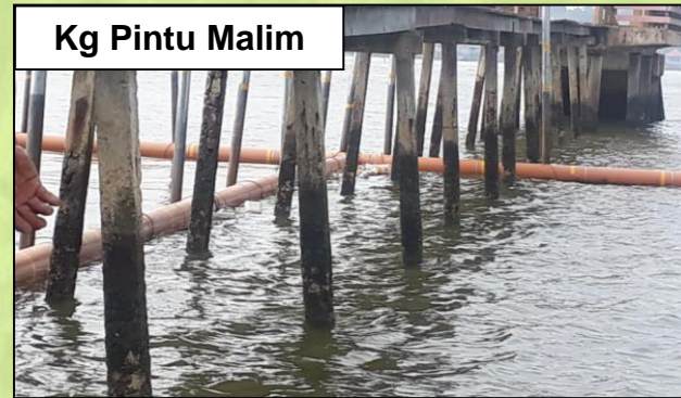
Kg Pintu Malim