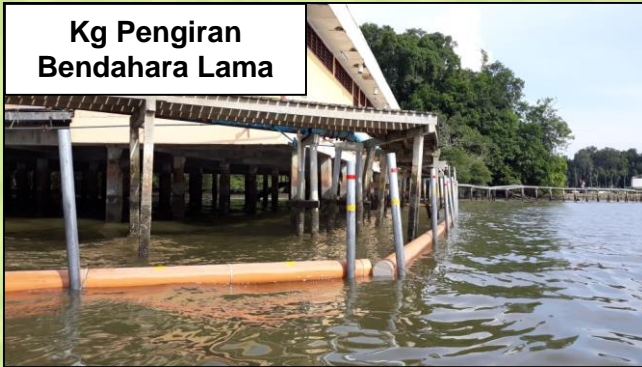
Kg Pengiran Bendahara Lama