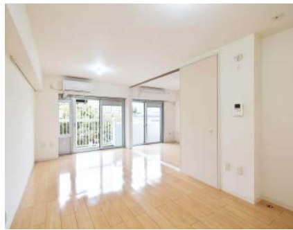
Provision of energy-efficient housing units

In fiscal year 2005, UR declared its Environmental Consideration Policy and has since promoted the development of environmentally conscious towns and housing. In light of recent environmental trends and to respond to increasingly diverse social demands, this policy was revised and reestablished as the Basic Environmental Policy on April 1, 2025.