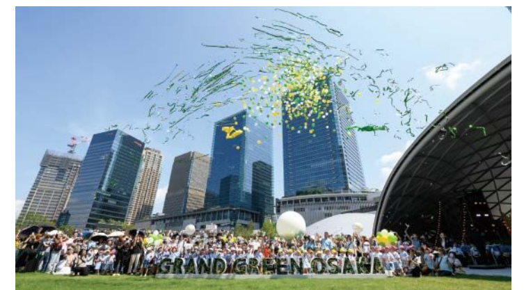
▲ Opening ceremony scene

UR is also working to evaluate the various social effects of greenery, aiming to visualize and quantify those effects. At the same time, efforts are being made to obtain environmental certifications and to promote biodiversity conservation and reduction of environmental impact.