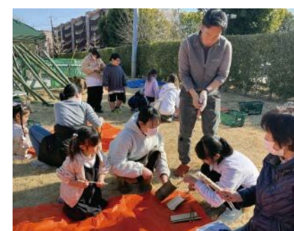
Hosting environmentally conscious activities at local exchange events