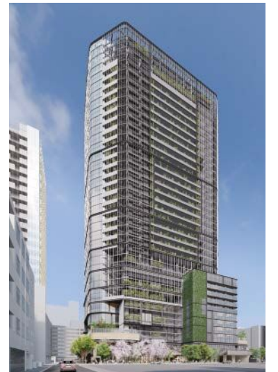
▲ Concept Image

Beyond this specific project, UR is also advancing environmental performance improvements in newly built rental housing more broadly. ZEH (ZEH-M Oriented) specifications are being standardized progressively, with the first such housing complex scheduled for delivery around fiscal year 2026.