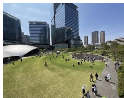
Partial opening of Umekita Park, which will serve as an evacuation site in the event of a disaster