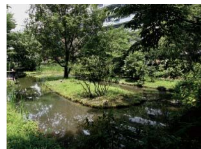
▲ Sunvarie Sakurazutsumi