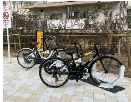
Involvement in pilot programs for mobility hubs, including bike-share ports