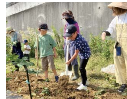
Enriching the urban lifestyle by integrating natural greenery