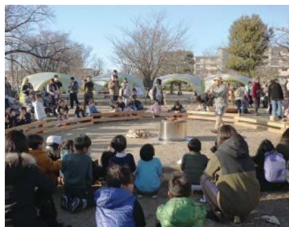
Efforts related to disaster prevention in housing complexes