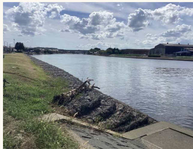
▲ Hinuma River, part of the Naka River system

As a result, the project plan received approval from the Minister of Land, Infrastructure, Transport and Tourism on June 28, 2024. The relocation project is now underway.