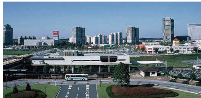
Chiba New Town Chuo Station (Chiba Prefecture)

The organization provided housing and land through large-scale development of new residential areas around major cities, which were suffering from housing shortages due to high population and industry concentration. Representative projects include Chiba New Town (Chiba Prefecture), Atsugi New Town (Kanagawa Prefecture) and Izumi New Town (Osaka Prefecture).