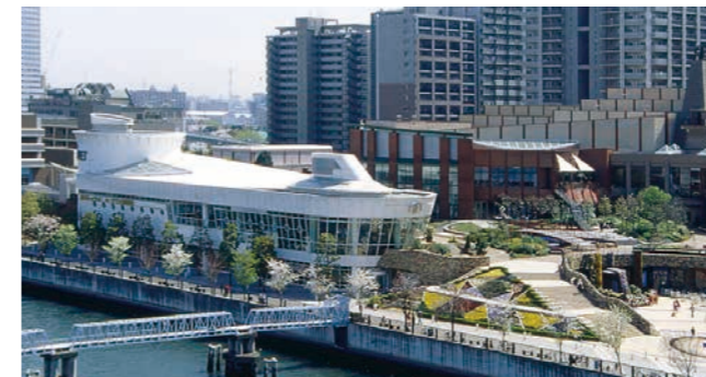
Harumi Island Triton Square (Tokyo)

The company improved living environments in large cities, and implemented disaster prevention measures to improve urban areas. The company also contributed to the enhancement of people's lives and economic development through the supplying and management of rental housing for families.