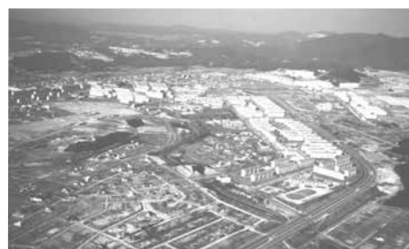
Kozoji New Town under development (Aichi Prefecture)