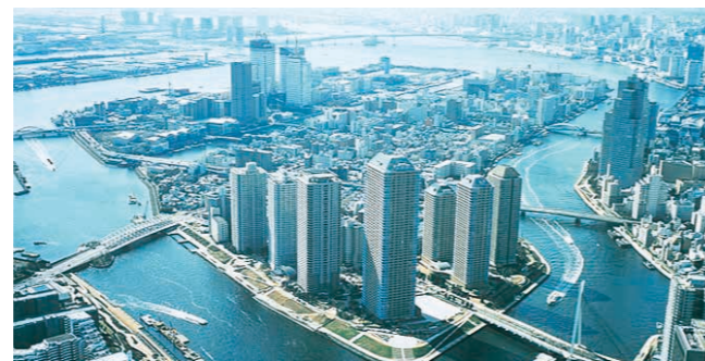
River City 21 (Tokyo)

Japan Housing Corporation and Land Development Corporation merged in 1981. The new company began providing apartment complexes and land with better living environments in large cities in urgent need of development, and undertook the redevelopment of cities by regenerating urban areas and urban parks.