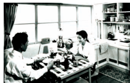
Kanaoka Housing Complex (Osaka Prefecture). A photo of a dining kitchen around 1960