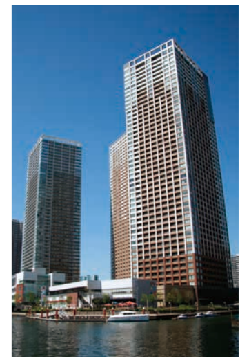
Shibaura Island (Tokyo)

Urban Development Corporation and the Regional City Development Division of the Japan Regional Development Corporation merged into UR in 2004. The agency is striving to redevelop cities by making use of the technology and knowhow accumulated over more than half a century, and continues cooperating with private businesses to create cities where people can shine.