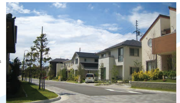
Shimanami Hills (Ehime Prefecture)

The company was established with the aim of balancing out the development of domestic land, vitalizing regions, and promoting dispersion of the population and industries, which had become conspicuously concentrated in large cities. Numerous industrial parks and facilities were developed to facilitate self-sustaining growth of regional industries, and new city centers were also developed.