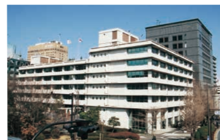
Japan Housing Corporation's Head Office (Tokyo)