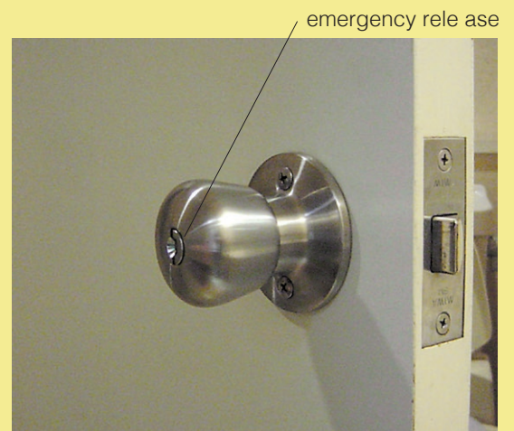
toilet door - exterior