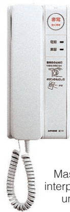
Master interphone unit