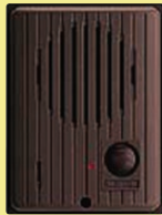
Door interphone unit